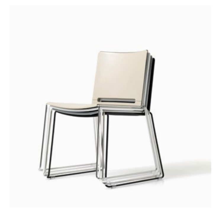
Black / White / Sand