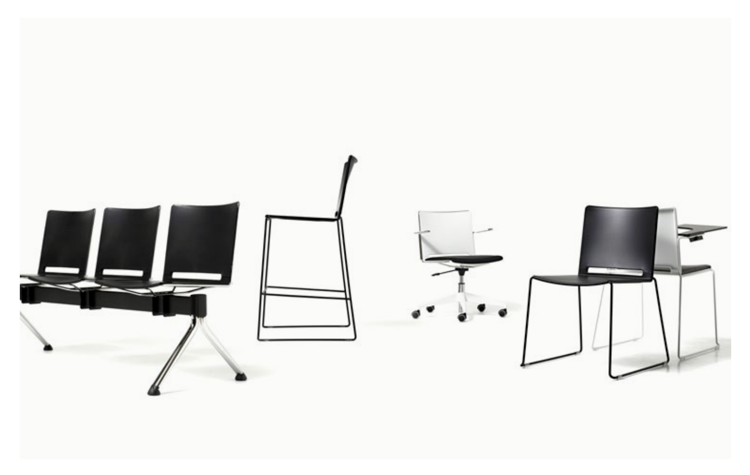
Black / White - Ikon 2230 / Black / White - Era CSE13

SLIM combines elegant design with ingenious efficiency to obtain the best performance from both an aesthetic and a comfort point of view. It has a distinctive feature that makes it extremely practical: Slim is stackable up to 40 pieces. Slim is well-proprtioned and minimalist, making it suitable for young, dynamic environments.