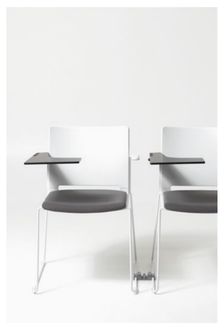
White - Era CSE13